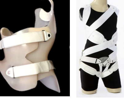
Hard brace / Cheneau vs.. Soft brace / SpineCor