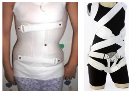
Hard brace / Cheneau vs.. Soft brace / SpineCor